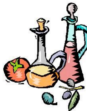
IMPORTED OLIVE OILS & VINEGARS

Welcome to the first of many newsletters from Pasqualina's Italian Market. I remember the first newsletter that I received—it was from a little restaurant in Moorestown, NJ, close to where I lived at the time. It contained some great stories, recipes from the owner/chef, and I remember thinking that if I ever owned a store or restaurant, I would do the same thing. I think it is a great way to learn about the people that are serving you and why they do what they do.