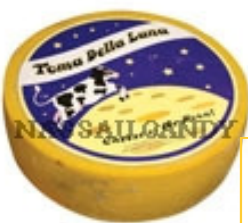
TOMA DELLA LUNA (Exciting Italian Swiss)